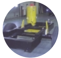
Chassis built construction