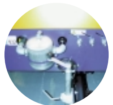
Optional 9 litre capacity in line lubricator for tools