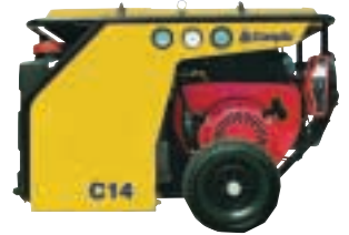
C14 portable compressor

Easy maintenance features, such as: Air/oil reclaimer external to pressure vessel on C20. Lateral drains for compressor and engine oils on C17 – C29. And spin on integral compressor oil filters (all models).