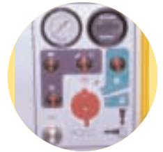
Lockable Control Panel – C20