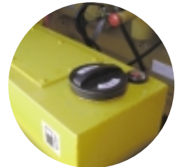
Fuel tank gauge and inspection plate