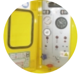
Easily understood control panel with lockable steel door

260mm ground clearance for easier positioning.