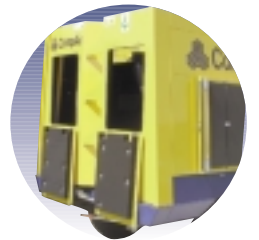
Rear doors open for cleaning cooler, ladder for cooler filling, rear parking brake